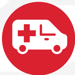
Mobile Asset Tracking