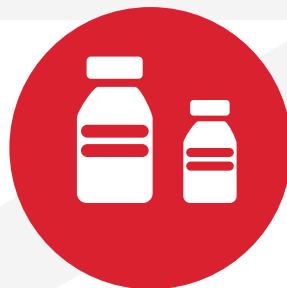
Test Sample Tracking