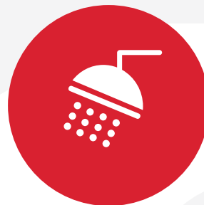
Hygiene Compliance Monitoring